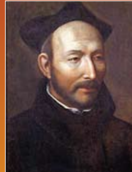
LOYOLA, SPAIN Birthplace of Saint Ignace of Loyola, founder of the Jesuits.