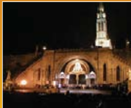
LOURDES, FRANCE Site of the apparition of the Blessed Virgin to Saint Bernadette in 1858.